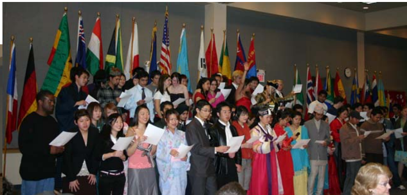
All of the international students join together to sing "Heal the