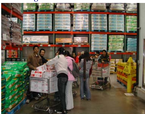
Students shopping for the dinner items.

"One World, Many Flavors" was the theme for this year's International dinner which was held on Saturday, February 25, at the Williams Conference Center.