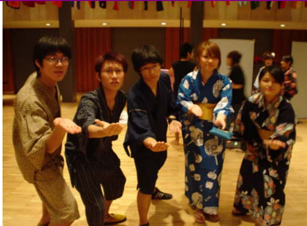
LCSC students greet participants at the Matsuri festival in Moscow, Idaho.

The Japanese Cultural Association was born at LCSC in 2005. Already, JCA members have held fundraisers, sang and danced in the LCSC International Dinner, tutored American students in Japanese, won the LCSC Fall 2005 Intramural Softball Tournament, and created cultural demonstrations for a Matsuri festival.