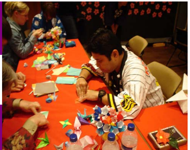
Japanese Cultural Association members (Left)