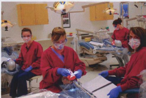
First-Year Students in Clinic

Thank you for your interest in our program.