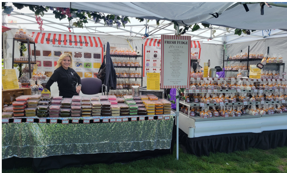
#1 Big Bear Chocolates