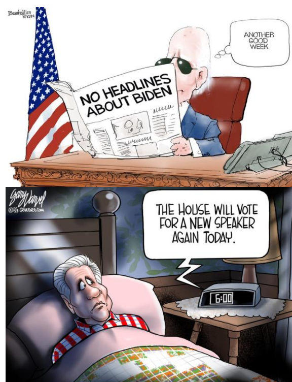
GROUNDHOG DAY 2023

Additional websites will be introduced throughout the term.