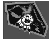
Nez Perce Nation