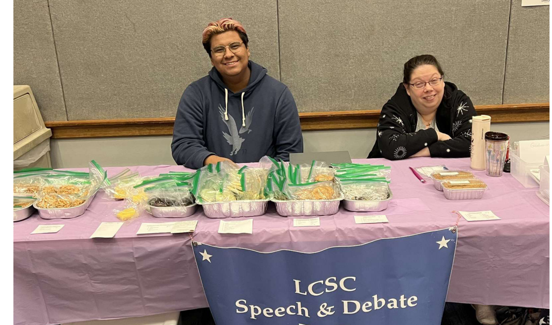
Speech and Debate Club selling baked goods

dors and clubs. We received great reviews from community members, students, and staff. Several students ended up making over $200 from their booths and WEB is hopeful that the market will continue with an even greater outcome in the near future.