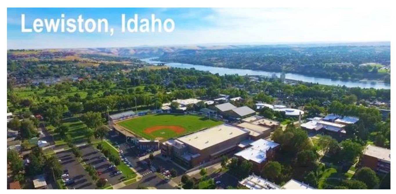
Aerial shot of the LCSC Campus, nestled in the Lewiston community, with the Snake River running along its western edge.

Lewiston is the county seat of Nez Perce County, Idaho, in the state's north central region. Lewiston is located at the confluence of the Snake River and Clearwater River, and it is the farthest inland seaport from the west coast. The City of Lewiston became a Tree City USA in 1988, and it maintains that designation today.