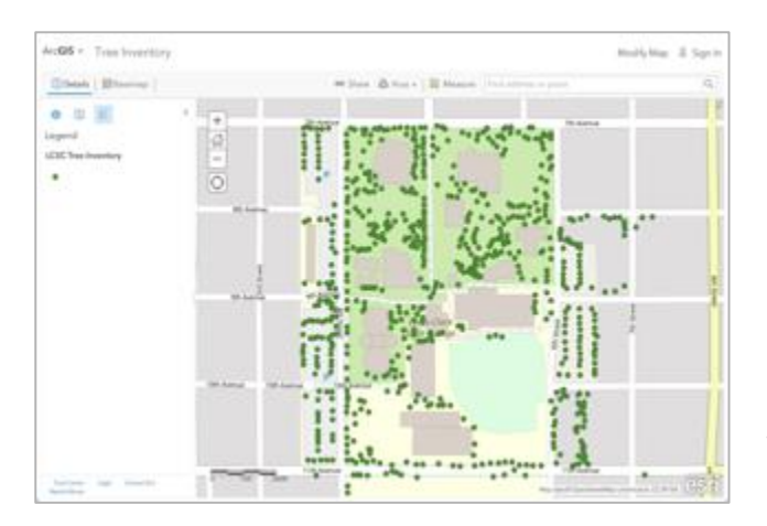
Screen capture of the Tree Inventory Map from the online database.

Information on data included in the Tree Inventory and a link to the data is provided in the Standard 2 – Campus Tree Care Plan > The LCSC Tree Care Plan > Goals and Targets > Tree Inventory section.