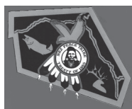
Nez Perce Nation